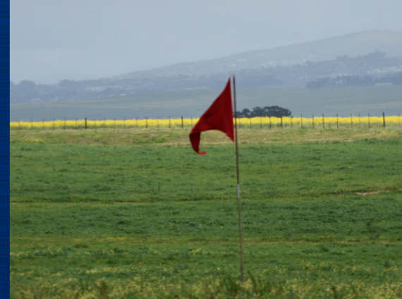
Wind behaving at 12:53

string of shots. This offers the shooter of a PCP rifle a highly predictable ballistic solution making PCP rifles an attractive option for ELR, relative to rimfire rifles. Rimfire shooters need to contend with a much higher extreme