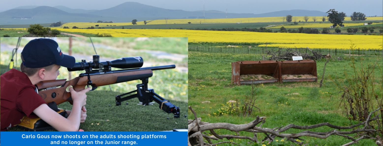
Carlo Gous now shoots on the adults shooting platforms and no longer on the Junior range.

attended by skilled shooters. Analysing the results and comparing it to previous matches we can clearly see how the scores have improved and how many more frequent hits are being achieved at the 393 meter and 424 meter targets.