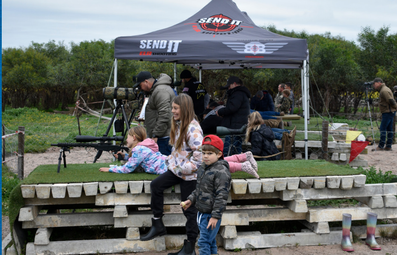
Family fun on the dedicated Junior range.