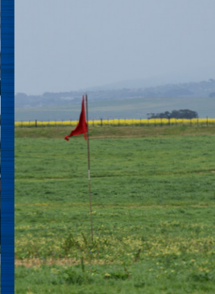
PEKS wind flag at 10:21