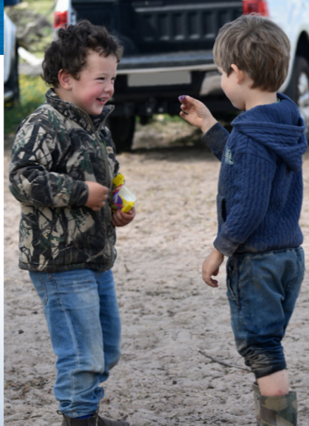
Youngsters enjoying making new shooting friends.